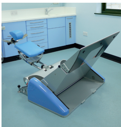
Single treatment position with three seating options