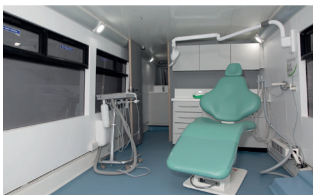
Dental surgery on top floor of London Bus