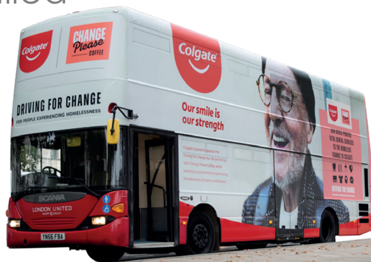
Bus transformed into a mobile dental clinic

The project was put together by charity Change Please, a coffee shop and social enterprise – with help from their sponsors HSBC, Colgate and their customers. They have now refurbished three London Buses with facilities to help the homeless including dental, haircuts, showers, banking and doctors.