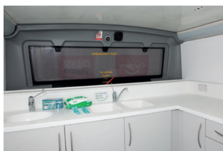
Decontamination Room at the rear of the top floor

It was quite a challenge to figure out how to do the dental surgery, what equipment to include and also how to run the services needed. We had to keep size, weight and power requirements to an absolute minimum. This has never been done before so we are pleased to have achieved a successful outcome that will help the homeless in London.